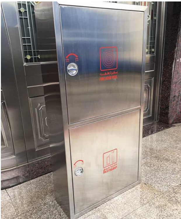
Stainless Steel Fire Hose Cabinet

Stainless Steel Fire Hose Cabinet is high quality stainless steel cabinet used for install and protect fire hose. It can support 30 meter flat hose. Installed indoor or outdoor where fire protection needed. Elegant looking with brushed finish, special material for anti-corrosive, rust proof.